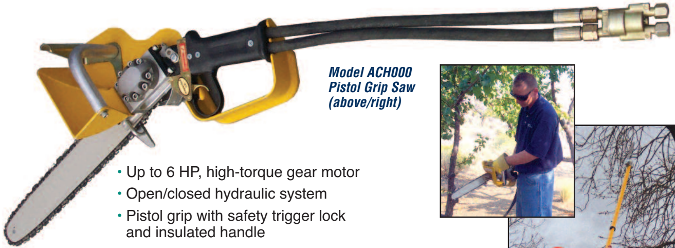
Model ACH000 Pistol Grip Saw (above/right)

Versatile, lightweight saw for utility and maintenance