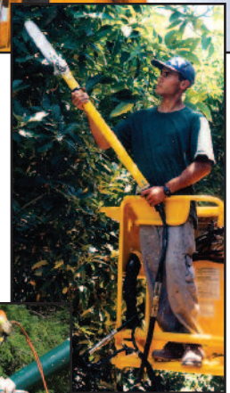
Model ACS-70 Pole Saw with optional 360° Hydraulic Hose Swivel (above/right)